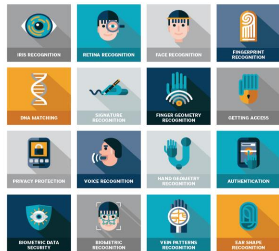
Fig.1 the various types of Biometric authentication

IRIS Recognition, retina Recognition, Face Recognition, Fingerprint Recognition, DNA Matching, Signature Recognition, etc.